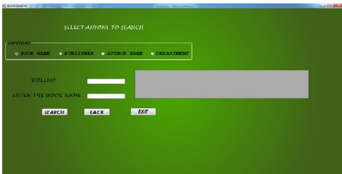
Fig.2 Book Search Form

Book renewal function changes Issue and Due-date of the book issue table. A librarian can send various types SMS to the students. If a student takes a book from the library, the librarian can send SMS to the student to remind about their due date to avoid the fine for the student, also to maintain the books in the library efficiently. A student can search the book in the library computer before searching it in the stack. When the searched book is not available i.e. somebody had already taken the book, then he can enroll his roll no and the book that he needs in the waiting list menu. After that librarian will send a SMS when the demanded book is returned to the library. Fig.2 shows the example of the book search form.